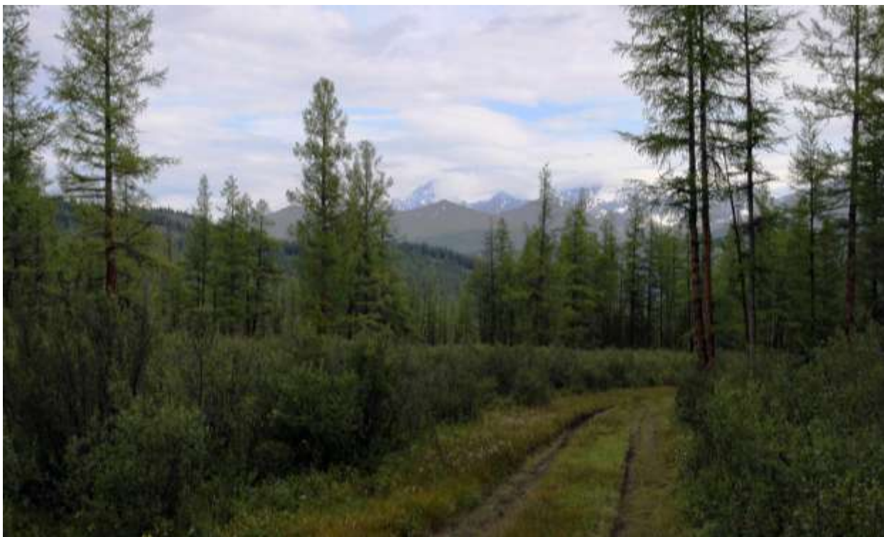
By the road to Djazator

Day 12 Trekking 18km to Ildigem river direction. Crossing the pass Bugimuiz, 2843m. Night in the tent.