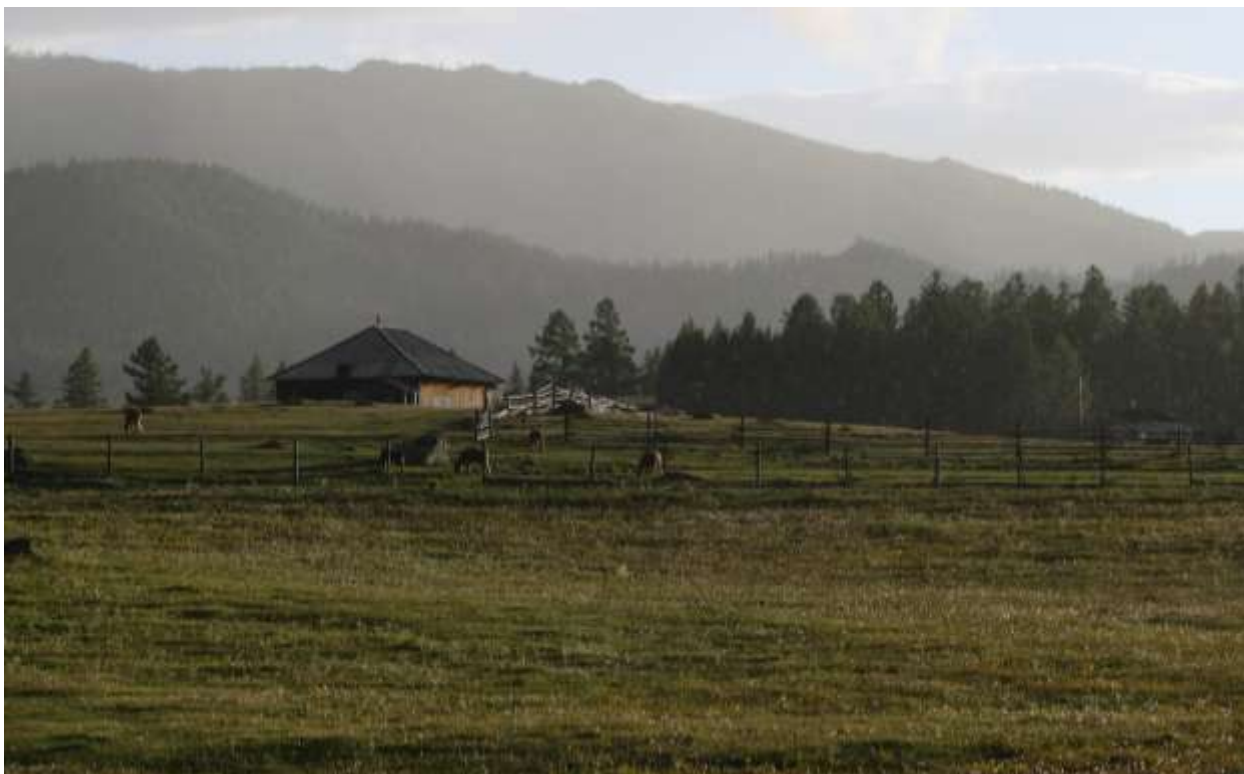
Rain in Djazator

Day 2 Transfer 200km, 5-6h to Kosh-Agach and after by natural road to Djazator village. Night in the guest house in Djazator. Evening time stuff preparing, have a dinner and national Russian sauna – banya.