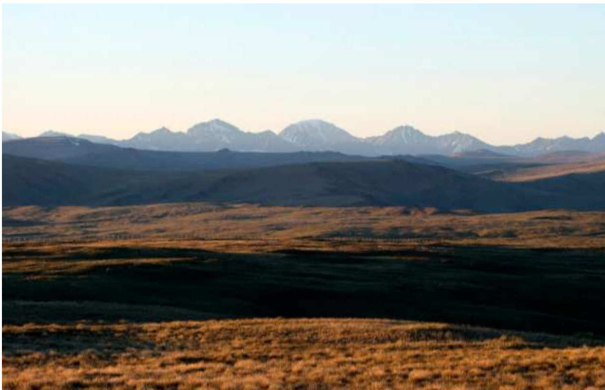
Sunset in Ukok