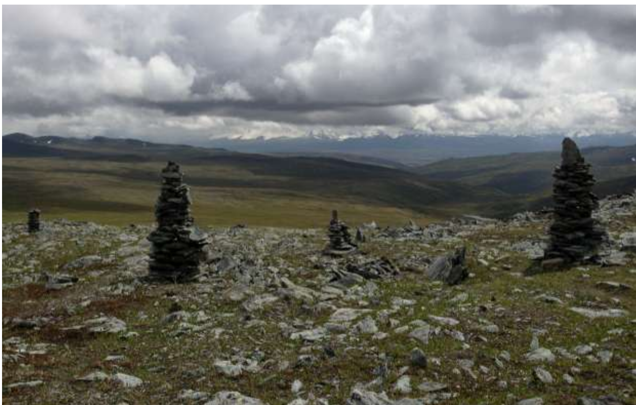
Tabyn-Bogdo-Ola ridge from Sudobay pass, 2800m

Day 4 Crossing the Sudobay pass, 2800m we reach valley of Karabulak river. First great view to whole Tabyn-Bogdo-Ola ridge. Tent camp. Trekking part 17km.