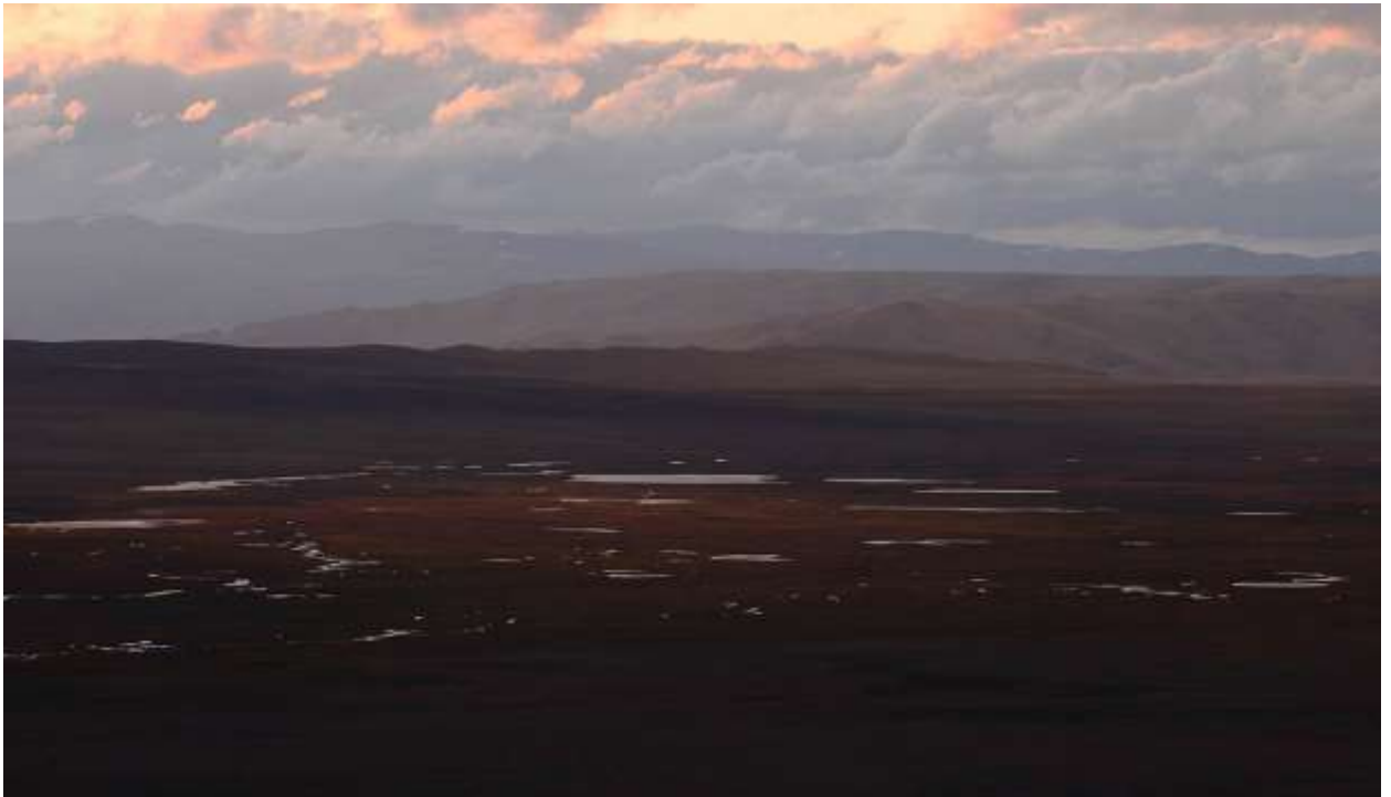
Lakes of Ukok plateau

Day 7 Trekking 12km to along Argamji river. Reach the moraine and put the Base Camp, 3000m. Some acclimatization hike little bit higher. Tent camp.