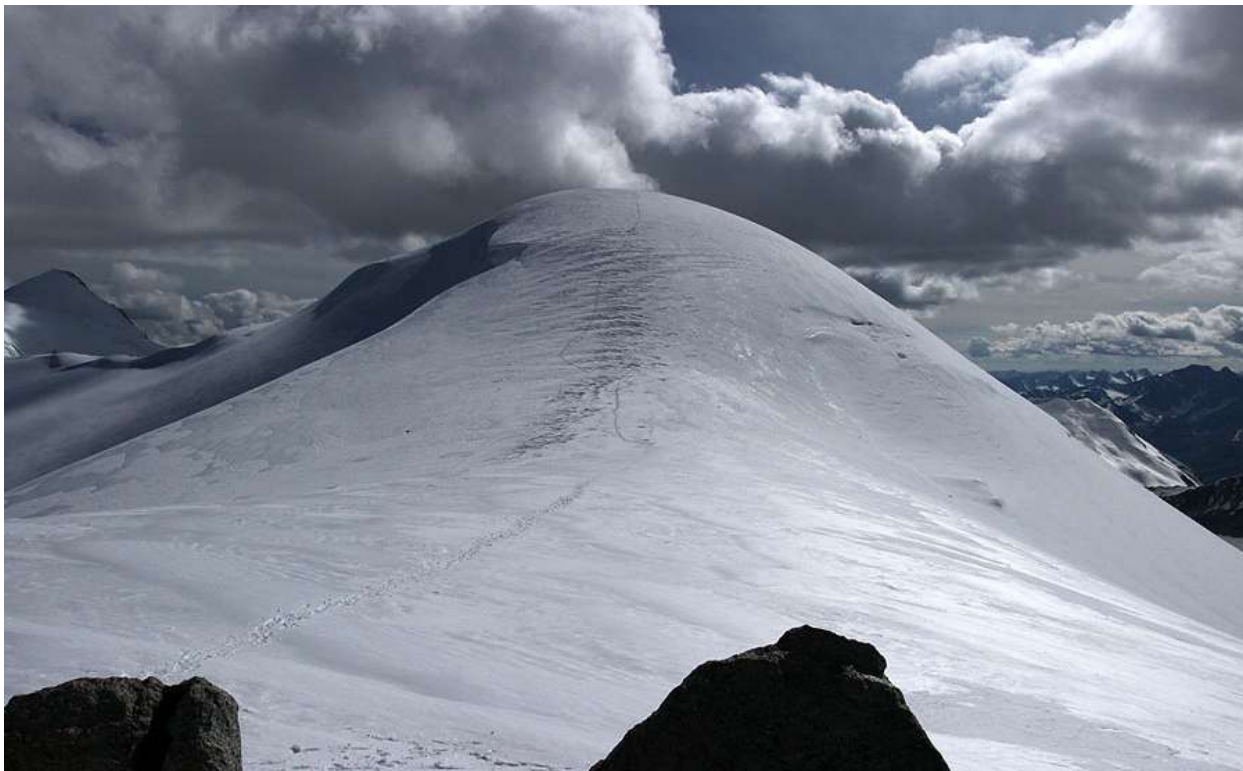
Top of the mt.Tabyn-Bogdo-Ola, 4082m

Day 8 Today is hard day. Ascension day to peak Tabyn-Bogdo-Ola, 4082m and if we will have enough time to peak mt.Russian Top, 4177m. Great view from the saddle to highest point mt.Nairamdal, 4372m. Base camp.