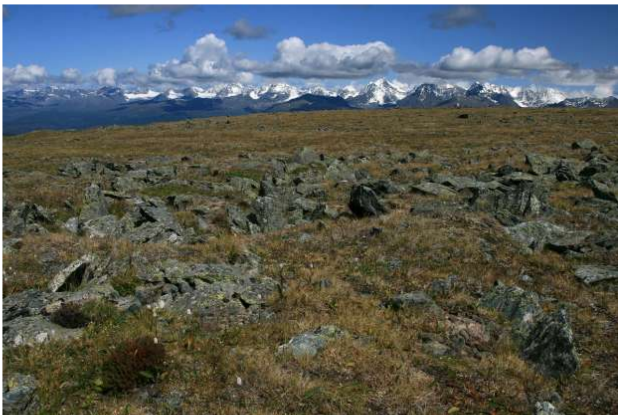
View of South-Chuiskiy ridge from pass Bugimuiz, 2843m

Day 11 Trekking 11km by Kalguti valley and crossing Karsulu pass. Night in the camp.