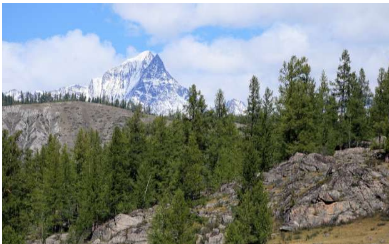
Mt.Iktu, 3941m, view from Sudobay river

Day 3 All common stuff put on the horses. Trekking 12km along Djazator river. Great view to the South Chuiskiy ridge and mt.Iktu, 3941m. Tent camp near forest line.