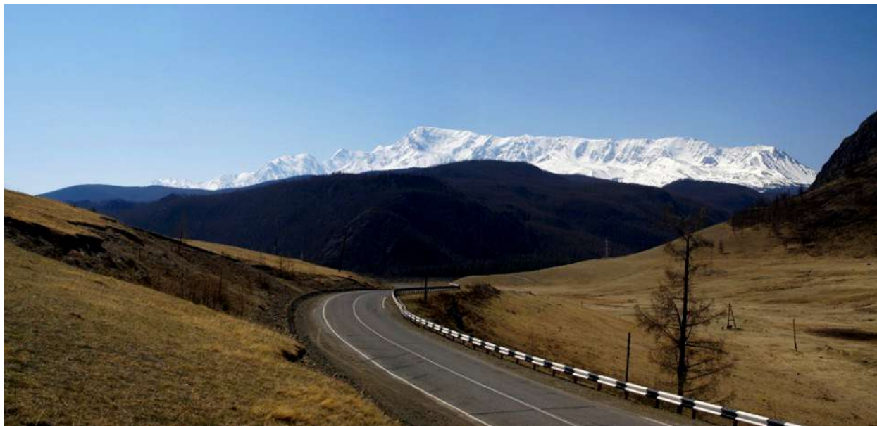
Chuisky trakt and view to the North-Chuisky ridge

Day 1 Arrival to Barnaul airport. Transfer 660km, 9-10h by Chuisky trakt to Aktash village, 1600m. BLD have during the way in café. Take permits in frontier post. Night in Taduyarik yurt camp.