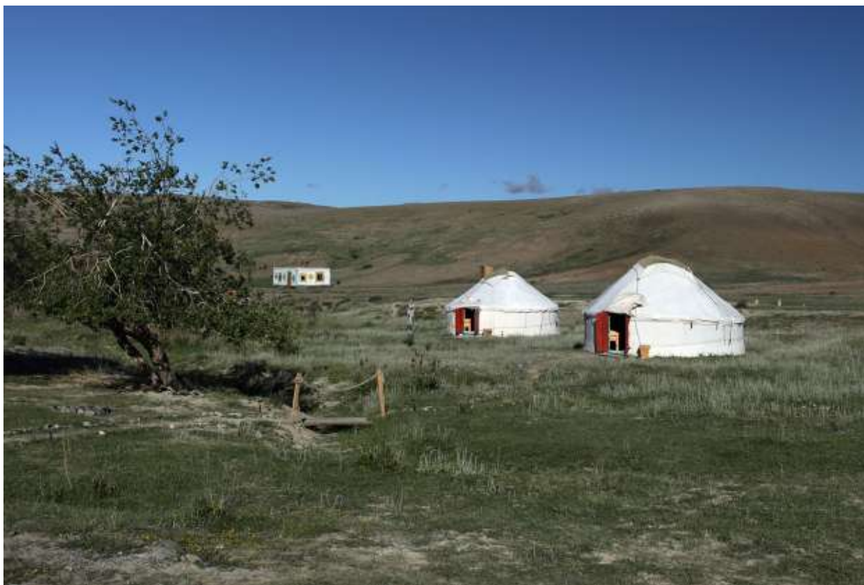
Taduyarik yurt camp

Day 1 Arrival to Barnaul airport. Transfer 660km, 9-10h by Chuisky trakt to Aktash village, 1600m. BLD have during the way in café. Take permits in frontier post. Night in Taduyarik yurt camp.