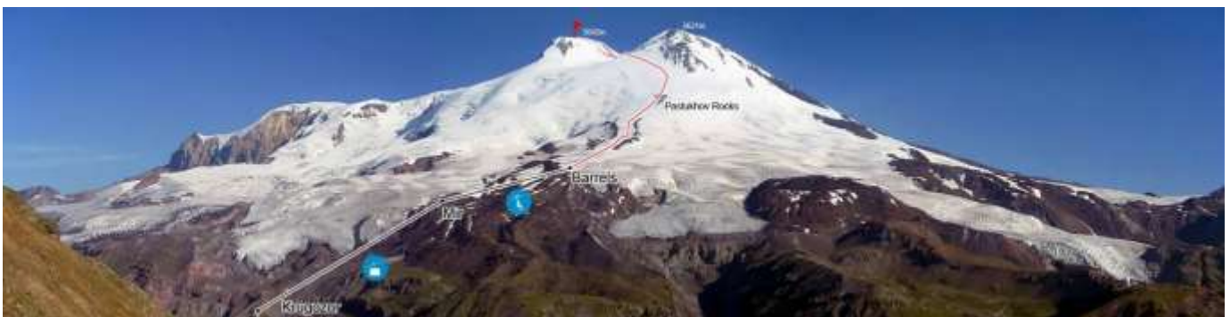
Way to Mt.Elbrus from the South

Day 11. Spare day to attempt Elbrus if the weather on the previous day was bad (otherwise return to the hotel).