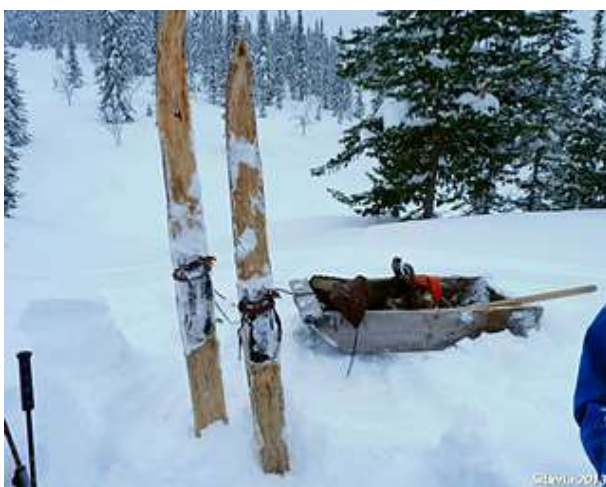
National Siberian skis