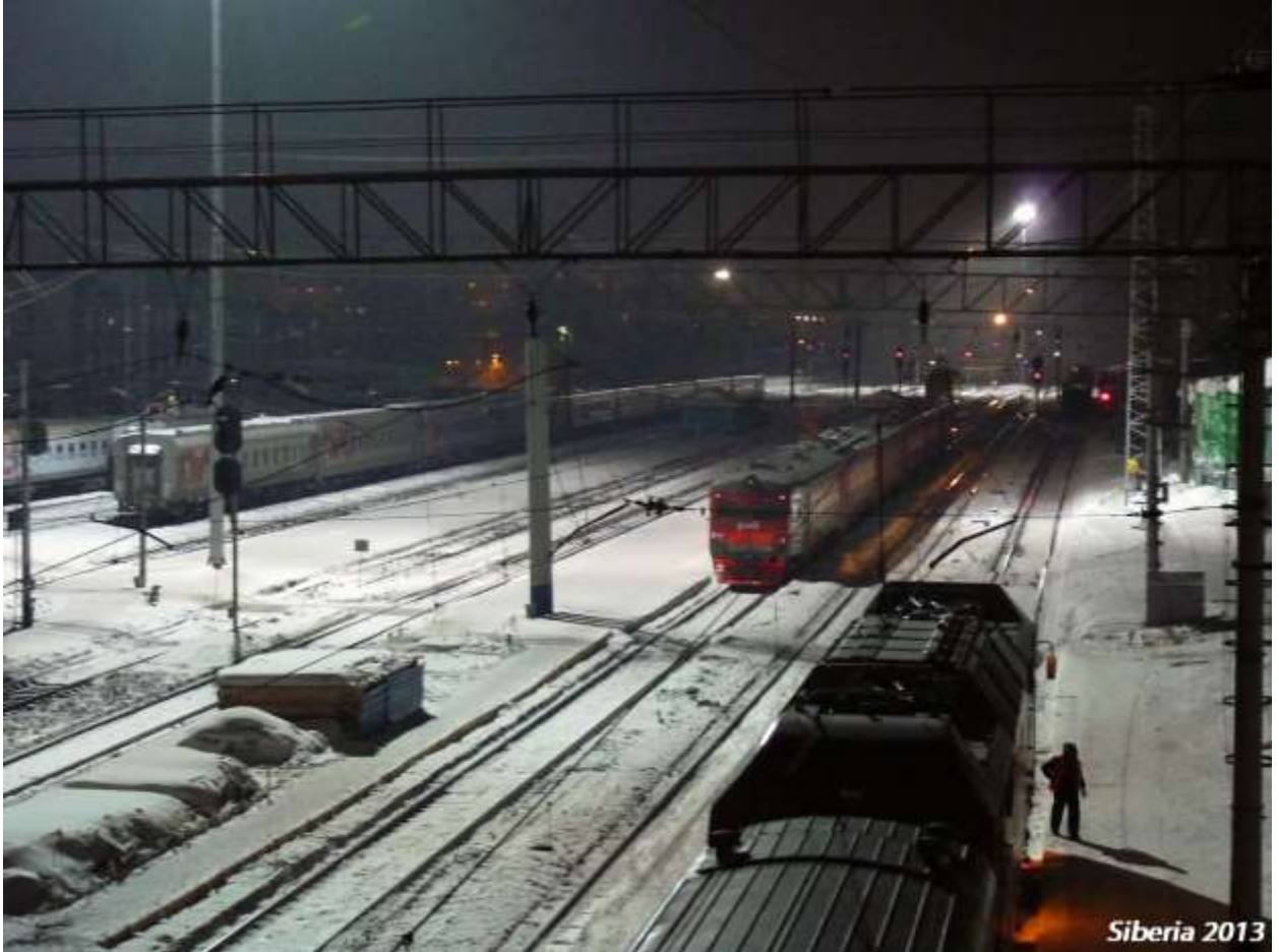
Novokuzneck train station

29 DEC/Day 1 Arrival to Novokuzneck airport (arrive at 05:25). Taxi transfer to the hotel 3*. Rest, shower, lunch and preparation before departing. Transfer to the train station. Evening train (3h, start at 21:20 and arriving at 00:40) to the Lujba station. All common equipment carries by snowmobiles to the hut. Accommodation inside common room in plank-bed.