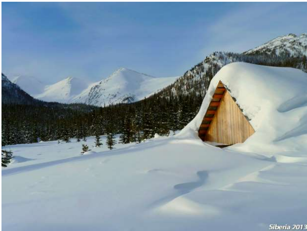
View to the main chain

01 JAN/Day 4 Today is one of difficulties day – after all this celebration and vodka! Because normally is free day but who want has light ski tour to the nearest mountain and downhill skiing.