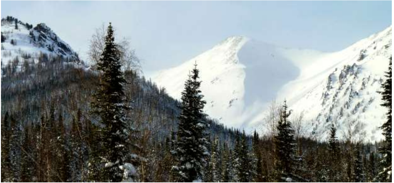
Mt. Bol'shoi Zub, 2045m

Price per person for the trip: 1045 € (6 and more person in the group)