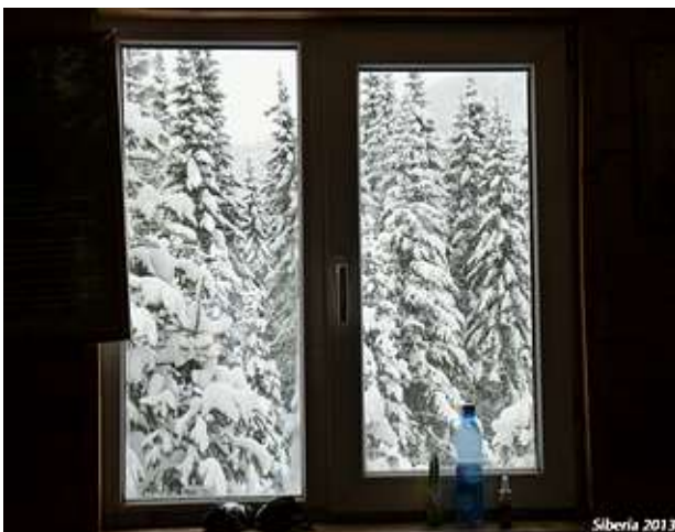
Lujba station hut

29 DEC/Day 1 Arrival to Novokuzneck airport (arrive at 05:25). Taxi transfer to the hotel 3*. Rest, shower, lunch and preparation before departing. Transfer to the train station. Evening train (3h, start at 21:20 and arriving at 00:40) to the Lujba station. All common equipment carries by snowmobiles to the hut. Accommodation inside common room in plank-bed.