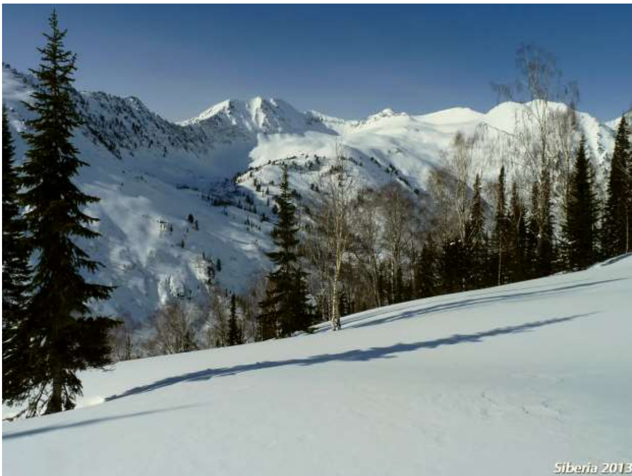
Circus of peak Zapsib

02 JAN/Day 5 It's time to start to get moving. Today ski tour 10km to Kugutu peak 1638m. Night in the hut.