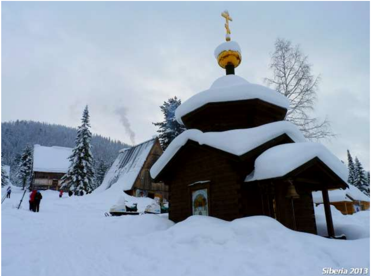
Orthodox church in the taiga forest