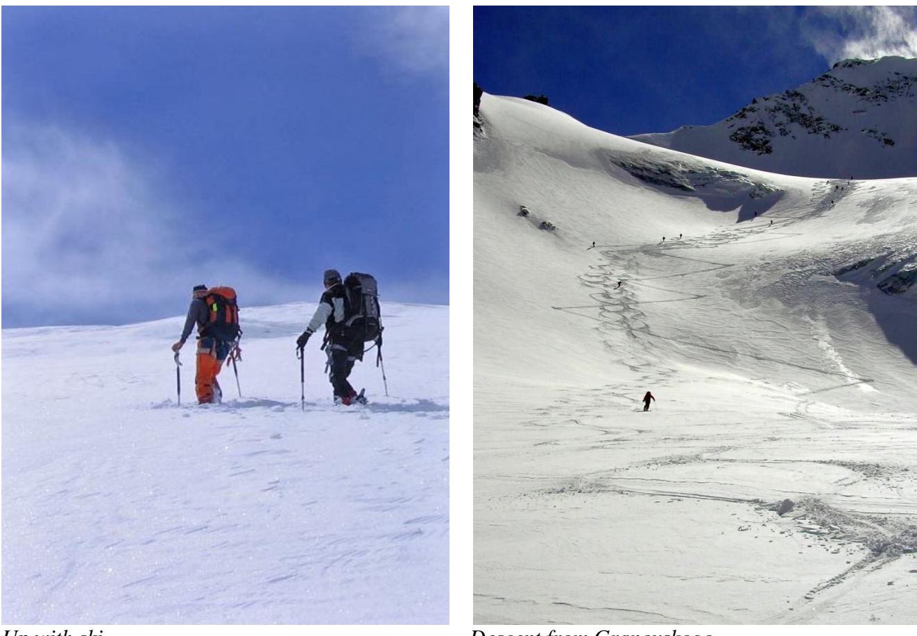
Up with ski