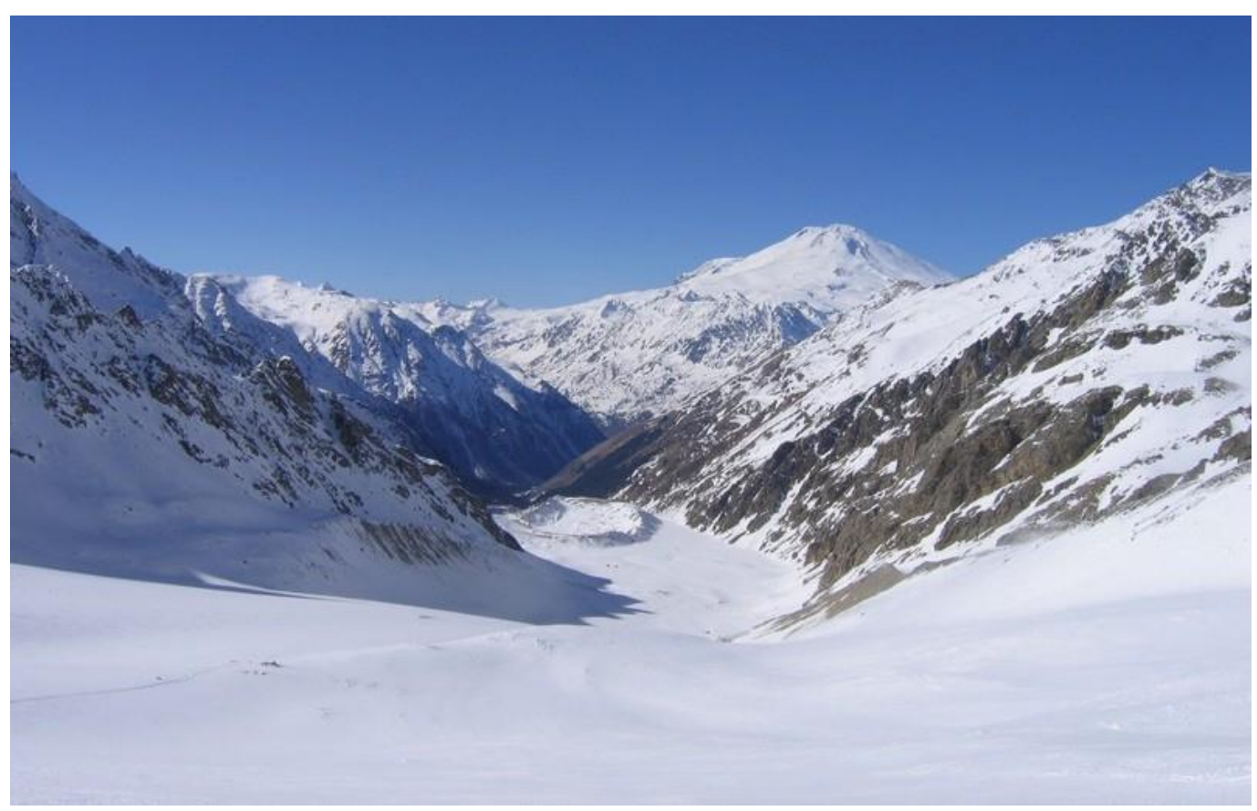
Adylsu valley from Djankuat glacier under Gumachi pass

Day 7, 29/04 Ski tour over the pass Gumachi, 3600m with climb to peak Gimachi, 3850m. The descent into Adylsu valley in the Mountaineering Camp Elbrus, 2050m. Refuge 2, 3, 4 bed room, shower, WC on the floor.