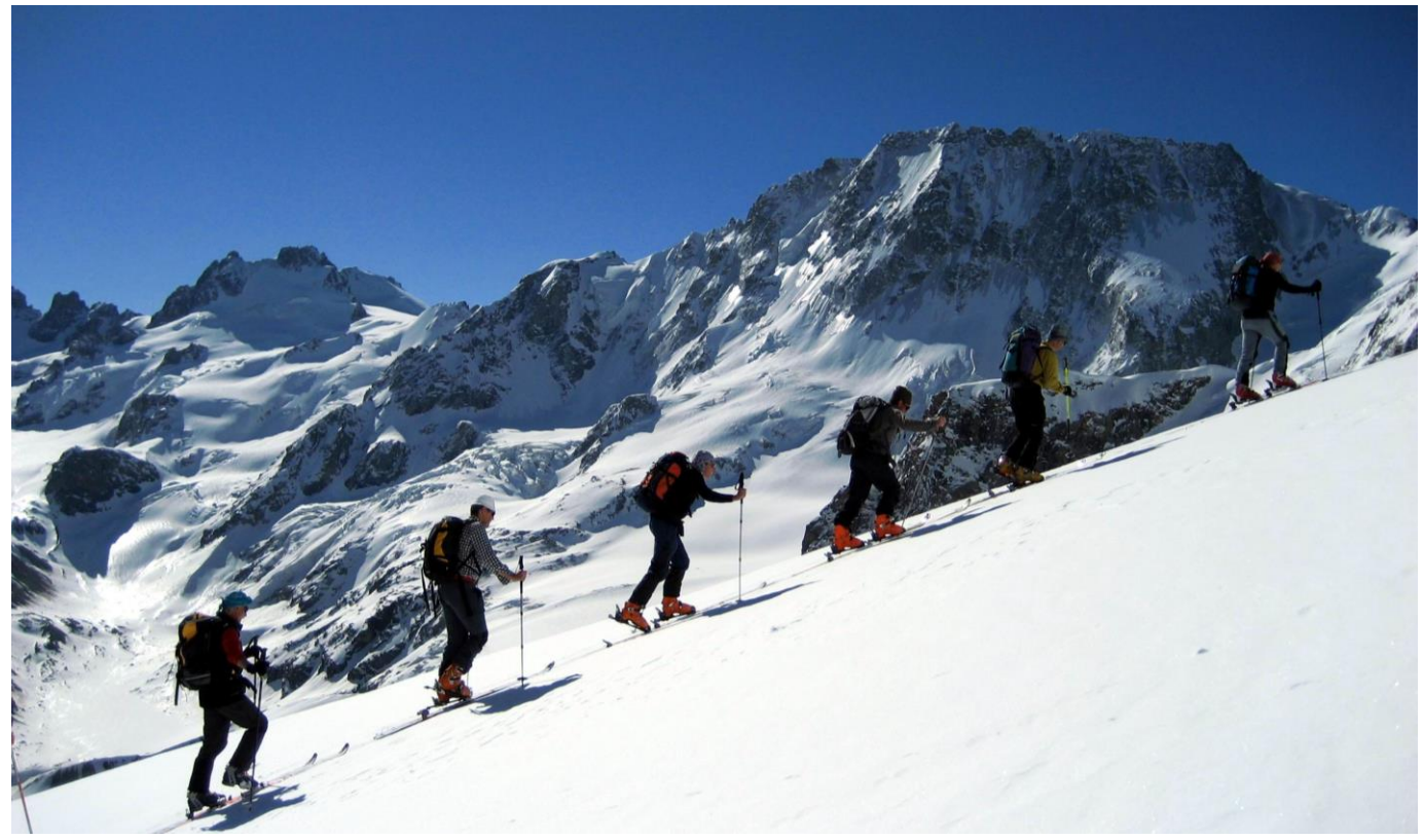
Up to Chotchat in front of Ullutau peak

Day 6, 28/04 Ski tour to the pass Granovskogo, 3759m, very long and beautiful descent along the Adyrsu valley. Descent to the hut Ullutau.